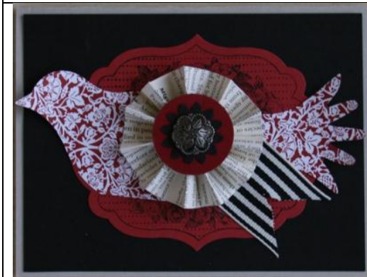
Leadership Conventon Demo