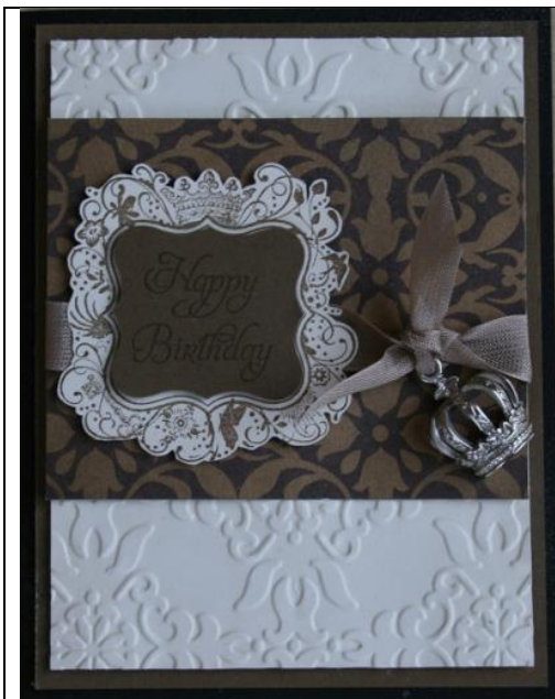
Crown or key . . .